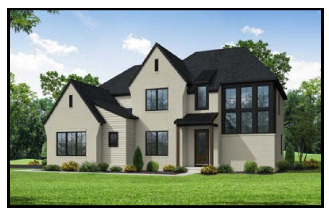
3,279 SQ FT | 5 BR | 4.5 BA